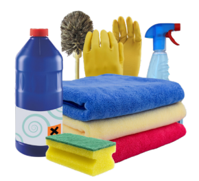
A trolly full of cleaning equipment