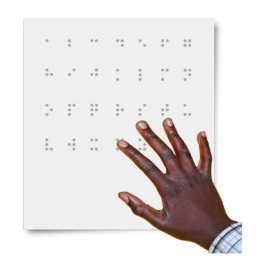
No tactile guidance