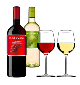
Large amounts of drinks